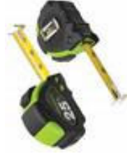
GRE 0155-25 Rule-Power Return 25 $12.11