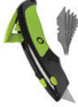
GRE 0652-11 Utility Knife w/Blades $7.47