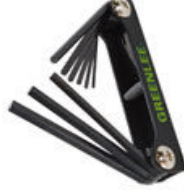
GRE 0254-11 9-Piece Folding Hex-Key Set: Sizes 5/64", 3/32", 7/64", 1/8", 9/64", 5/32", 3/16", 7/32", 1/4" $5.81