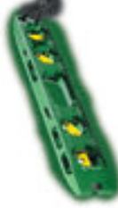
GRE L107 Electrician's Torpedo $41.76