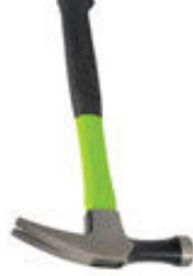
GRE 0156-11 18 oz. Electrician's Hammer $28.10